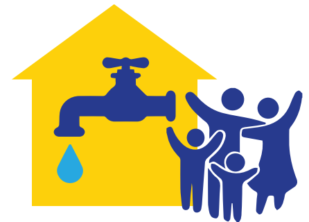
We get clean water!

Our responsibility to check water pipes in our homes and manage water use