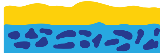
San Gabriel Basin

LA County Department of Public Works oversees water in the spreading grounds that add to our groundwater supplies